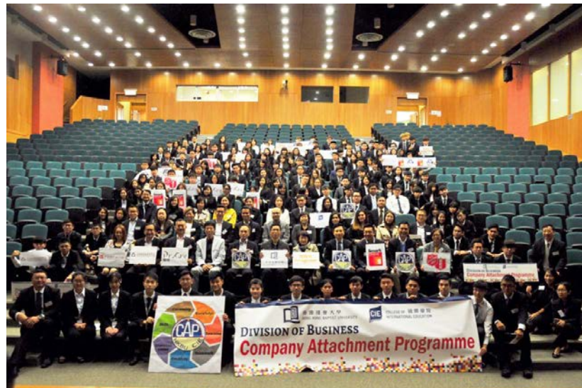
Company Attachment Program

Cancer Foundation and Jewelers for Children and other charitable organization. The Group works with local education institution to provide internship or job opportunities to local students so that the students were given the chance to work with our Group. During the Reporting Period, we participated in care for the youth programme, the “Company Attachment Programme” organized by the College of International Education of the Hong Kong Baptist University. The students were invited to introduce new marketing initiatives to the Company and worked with the Company’s designing team. The marketing team has also provided case studies for the students to know more about the business world and the jewellery industry. The Jiangmen Factory has worked with local institution to provide internship programme and organize guided tour in the Factory for the students. During the Reporting Period, the Company has charitable contributions totaling HK$120,000.