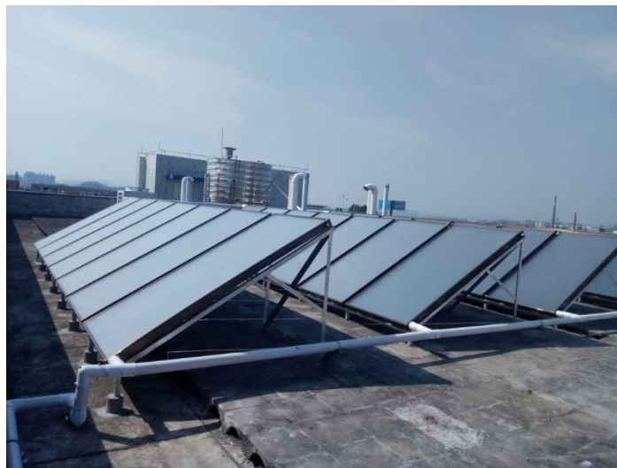
Jiangmen Factory – solar heating system